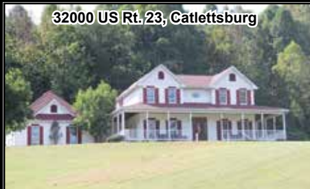
32000 US Rt. 23, Catlettsburg

SPECTACULAR! 2 story home w/wrap-around porch on 111.63+/- Acres in Boyd Co. Add'l 8+/- Acres (per PVA) lying in Lawrence Co. Beautiful cherry cabinets in kitchen, LR & office. Gorgeous woodwork & HW flooring, 3 bay garage, 3 story barn, 2 ponds (1 fully stocked), gazebo, IG concrete pool w/brick & wrought iron fencing, pool house w/kitchenette, BA & living area. Sq.Ft. is apx. At this price, property is being sold "AS IS." Price is FIRM! Qualified Buyers... Call for your private showing! K-4 $575,000