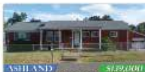
ASHLAND $139,000 3404 WILLIS AVE Charming 3 BR, 1.5 bath brick ranch home located within walking distance to Poage Elementary school.