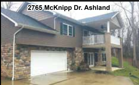
2765 McKnipp Dr. Ashland

Nice contemporary home on 1.91+/- acres in Boyd County. Home features MBR & BA on main level as well as a 2nd BR & another full BA. Family/dining combo with gas log fireplace to cozy up to. French doors on main level and bsmt lead out to a covered deck and patio. Kitchen has lots of cabinet space, glass backsplash and SS appliances. Bsmt has 2 BR w/double closets, recreation/LR & full BA. 3rd BR ins bsmt has had carpet removed & needs new flooring. Entertaining your guests on the lg deck, take a dip in the AG pool or relax in the hot tub. 2 car garage with oversized driveway. Call today for your private showing! K-10 $285,000