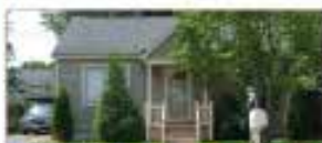
ASHLAND $89,900 3115 CHARLES ST This charming 4 BR / 1 bath, 1.5 story cape cod is the house for you! This house is ready to welcome you home.