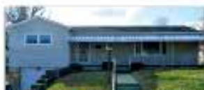
ASHLAND $229,900 520 LONG ST This 3+ BR, 2 full bath ranch home on a corner lot has lots of storage and is ready for a new homeowner! Must see!