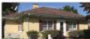
ASHLAND $89,900 1401 NICHOLS PLACE Brick ranch home on corner lot. 3 BRs and a 2 car garage. Close to college, shopping and restaurants.