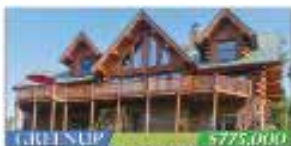
GREENUP $775,000 507 HAMMER MILL RD Peace and tranquility await you at this Amish custom - built log 4 BR, 4 full bath home located on 10 acres.