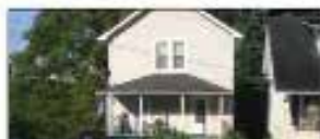
ASHLAND $12,500 1121 FIRST CIRCLE PROSPECT New roof, and rafters. 3 BR, LR, kitchen, DR, and 1 Bath on upper floor. Parking pad. New electrical.