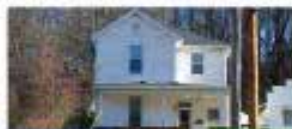
ASHLAND $98,500 1315 OAKVIEW RD Residential or Commercial. Charming 3 BR/1.5 bath home offers hardwood floors. Large fenced-in backyard.