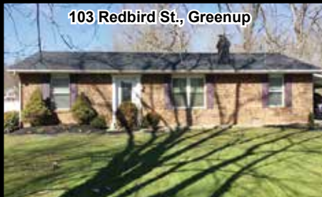
103 Redbird St., Greenup

Must See! This 3 BR, 2 BA brick ranch was extensively remodeled in 2012. Crown molding in all but 2 rooms, laminate flooring in LR and MBR (2 yrs old). Fireplace has a handmade mantel and is surrounded by AirStone. Eat-in kitchen has beautiful cabinets, countertops, stainless steel appliances and ceramic flooring. Enjoy the 3 level deck which is great for entertaining, each level has electricity. Outdoors there are hot and cold water faucets. House has an EcoSmart water heater, roof is 2 yrs old and fenced back yard with enough room for a pool. Call today for your private showing! J-1 $134,000