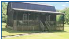
1736 E. Midland Trail, Grayson - 3 BR, 1.5 BA, 2 story Cape Cod about 2 yrs old on 9+/- acre.