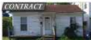
CONTRACT ASHLAND $299,900 2718 BEECH ST Looking for an investment property, look no more. 2 BR/1 ba. Needs a little TLC but has great rental potential!