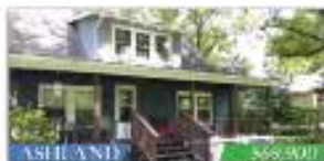
ASHLAND $65,900 530 BLACKBURN AVE Located at the end of the access with approximately 1.8 acres per registered survey. 2 BR, 1.8 KIT., and DR.