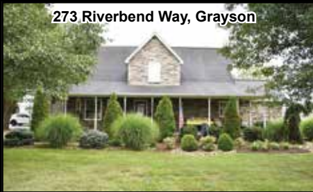
273 Riverbend Way, Grayson

What's behind the custom doors of this 1.5 story home? An exquisitely designed 3 BR, 2.5 BA home. From the time you enter the foyer, you will fall in love! Foyer has vaulted ceilings and custom airbrushed painted walls. Upstairs you'll find 2 BR w/double closets & full BA. Off the foyer is the dining area where you can see the stunning kitchen designed with beautiful light fixtures, "one-of-a-kind" granite counter tops and high-end appliances. LR w/beautiful bar w/ice maker and wine refrigerator. Relax to the sound of the built-in wall water fountain or gaze into the flames of the wall fireplace inserts. FR w/stone fireplace with gas logs. Master ensuite w/spacious walk-in closet. WANT MORE RELAXATION? Step outside to private outdoor living area with small pond, 36x18 heated pool w/power cover & pool house w/kitchenette, bath & small living area on one side and area for towels, equipment, chemicals, etc., on the other side. Outdoor grilling area is built in the center of the pool house. Covered front porch, oversized 2 car garage, extra parking area, brick fence w/wrought iron gates, water fountain in pool area, storage shed and beautiful landscaping. Call today for your private showing! K-17 $490,000