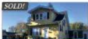
SOLD! ASHLAND $109,900 2637 IROQUOIS AVE CHARMING and COMFORTABLE family home in a convenient Ashland location -- 4 BRs/2 full bath.

Let Us List Your Home And YOU Can Experience THE PARAMOUNT DIFFERENCE!