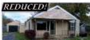
REDUCED! HAW WOODS $69,500 1105 WILLIAMS ST 3 BR, 1 bath home. Fenced back yard. Single car garage w/ covered area on side. Call for an appointment today.