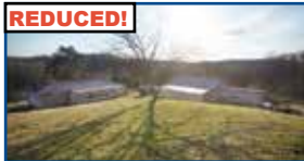
193 Rabbitery Rd., Wurtland - 3 BR, 1 BA, 1,300+/- Sq.Ft. 37+/- ACRE farm offers tons of space for farming or hunting. $159,900 (TCM/SB)