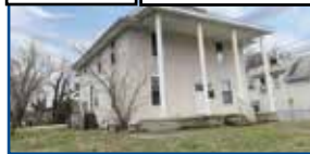
318 52 nd St., Catlettsburg - 5 BR, 2 BA, 1,900+/- Sq.Ft. Recently converted from 5 BR home to duplex w/2 separate rental incomes. $139,900 (CH)