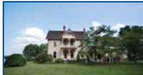
1023 Riverside Dr., Greenup - Beautifully restored Italianate Victorian home w/river views from every room. 6 BR, 4 BA and 5+/- peaceful acres fronting the Ohio River. On the National Register of Historic Places. $599,000 (TM)