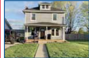
2726 Monroe St., Ashland - 3 BR, 1.5 BA, 1,402+/- sq.ft. $164,500 (CCJ)