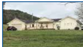
418 Wilson Creek Rd., Grayson - Great country location close to town. Beautiful 3 BR, 2 full BA w/2 car garage! Stunning views with so much to offer! Don't miss out! $129,900 (LG)