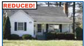
1612 KY Hwy 8, S. Portsmouth - Nice well maintained 3 BR, 2 BA, 1,800+/- sq.ft. home on 2.67 acre lot. Lg 2 car det. garage & outbdg. $122,500 (LG)