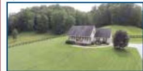
1243 Smith Branch, Grayson - No, this isn't a park! But you are entering a fairy tale! Don't miss this beautiful property w/3 BR, 2 full & 2 half BA, 2 car garage and 20+/- Acres! $439,900 (JB)