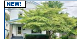
106 Grove St., Russell - Attention Investors! You will love this 4 BR, 2 BA adjacent to Ohio River on charming brick street. Hardwoods under carpet, new windows, 10 ft ceilings, original woodwork & huge front porch! Amazing flip or rental. $59,000 (TCM) (SB)