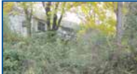
13784 St. Highway 986, Olive Hill - Selling house "as is." Has been vacant before 2-24-12. Nice land that is adjacent to Grayson Lake. Has a barn on back of the land that needs work. $59,900 (PC)