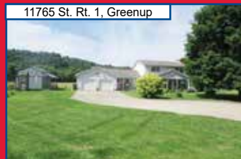
11765 St. Rt. 1, Greenup

Commercial property offering between 2,000 and 3,000 sq.ft. in Boyd County. Office space with two restrooms, central heat/air, and private parking on a main road. $159,000 Call Dale Hensley for more information 606-922-9771