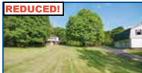
207 Blevins Lane, Greenup - Stately & Elegant 4 BR w/magnificent Great Room w/wall of windows providing abundant light & breathtaking views. This private oasis offers 41 usable gorgeous acres, 40x28 3-bay garage/barn w/enormous loft. $435,000 (TCM)