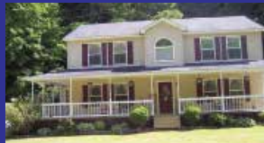
3525 St. Hwy 396, Olive Hill $149,900 3 BR, 2.5 BA, 4+/- acres. Nice 2 story in country setting, WB frpl, 2 heat pumps, wrap-around porch plus more. Franci Burchett 923-6168