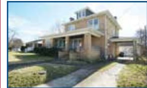
3404 Ridgeway Dr., Ashland - 4 BR, 1.5 BA, 1,644+/- Sq.Ft., 1 Car Det. Garage. $74,500 (CCJ)