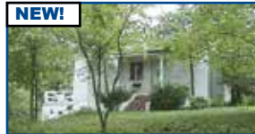
934 Dysard Hill Dr. - This home has never been on the market. It is 3 BR, 2.5 BA w/ HW floors & att. garage on 1+/- acre atop Dysard Hill on a dead-end street. The view is one of the best in Ashland. You must see yourself to appreciate. $68,000 (LG)