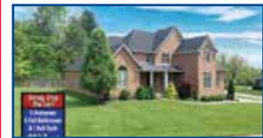
1264 Ivy Creek, Bellefonte - Lg home built in 2012. Very 'Desirable Dimensions' w/4,812+/- sq.ft., 5 BR, 5.5 BA, 3 car garage. Every BR has full BA, so no more fighting in the mornings! $499,500 (CCJ)