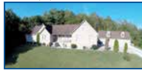
501 Crites Dr., Flatwoods - 4 BR, 3 BA on 5.22+/- acres in Russel School Dist. Lg foyer opening to an over-sized FR w/vaulted ceiling & HW floors, great eat-in kitchen & breakfast area. Private MBR suite w/vaulted ceiling. 3 add'l lg BR w/2 BA. Plus 2 car att garage & 2 car det 24x50 garage. $399,900 (JB)