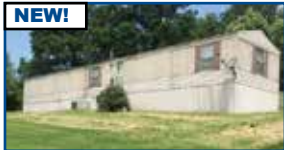
5607 Small Blvd, Ashland - This home features 3 BR, 2 BA, spacious living room, kitchen, eat-in dining w/vaulted ceilings. Appliances stay including washer & dryer. Newly installed wood-look flooring in LR/DR area. Lg deck. 2 car det. block garage w/opener. $79,900 (LS)