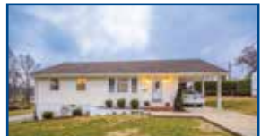
2713 Northview Rd., Ashland - 3 BR, 2 BA, 1,472+/- Sq.Ft. Updates, Great Location & Immaculate. $129,900 (AY)