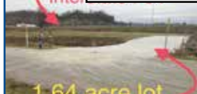
Everman St., Grayson - 1.64 Acre Commercial Lot Off I-64 Exit 172 In Grayson. $495,000 (CCJ)