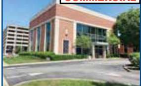
1737 Carter Ave., Ashland - $725,000 (CCJ)