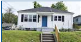
549 Gartrell St., Ashland - Move-in ready! This cute doll house has new windows, kitchen, new flooring, roof, sheetrock downstairs, new front & rear doors., interior doors & light fixtures. Looks awesome. $69,900 (GD)