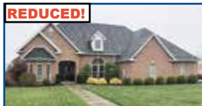
10013 Windsong Ct., Catlettsburg - 3 BR, 3.5 BA, 2,800+/- sq.ft. Everything you need on 1 level. Open concept Living/Dining room combo. Spacious MBR with ensuite. $369,000 (KG)