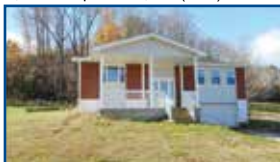
211 Teague Dr., Greenup - Lovely remodeled 3 BR w/lg kitchen, newer BA, roof, windows, sheet rock & paint. Deck in rear & unfin bsmt. $124,900 (LS)