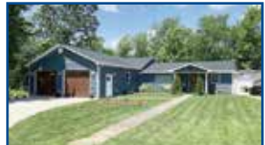
2601 High Park St., Ashland - 3 BR, 2.5 BA, 1,782 Sq.Ft. $154,500 (CCJ)