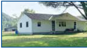
101 Linda Lane, Greenup - 1 Floor ranch home offering 1,484 sq.ft. w/3 BR & 2 updated BA. MBR has lg MBA w/10'x9' walk-in closet. Lots of potential to add on. Bring your horses & livestock to graze on this flat 14 Acre Mini-Farm. Nice 50'x50' barn. $155,000 (CCJ)