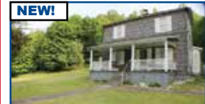
1217 N. Hwy 3, Louisa - This 3 BR, 1 BA featuring 25 acres has great hunting property near Yatesville lake. Also has flat land to build & a barn. $100,000 (EM)