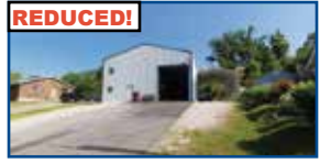
843 Greenup Ave., Raceland - Your very own COMPOUND! Lg 80x40 metal bldg w/2,000 sq.ft. updated 2 story home w/3 BR, 2 BA, 2 LR, walk-in closets & gym-- all under one roof! Park your RV/ Boat/Extra vehicles to the side under the massive 42x18 carport. $159,500 (CH)