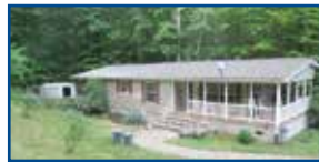
675 Stinson Creek, Grayson - Beautiful private setting with 2008 doublewide w/6" walls. Laminated floors, new metal roof in 2018, wood stove w/fan, nice front porch with side access. Well maintained with several outbdgs. $149,900 (PC)