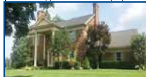
101 W. Stovall Lane, Grayson - Elegant luxury home with breathtaking view of the city skyline on 25+/- acres w/4 BR, 4.5 BA, 3 lg well kept barns & 1 lg bldg for equipment & storage. $595,000 (JR)