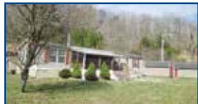
21835 Long Branch Rd., Rush - 3 BR, 2 BA, 1,530+/- sq.ft. on a 2 acre lot. 12x30 barn and 3 add'l outbdgs for storage. $139,900 (PEC)