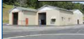
5005 Lake Bonita Rd., Catlettsburg - PRIME COMMERCIAL LOCATION! Within 3 to 4 minutes of I-64 & US 23 intersection. 42+/- Acres. Commercial Warehouse/Bldgs, offices & mobile home. $650,000 (CCJ)