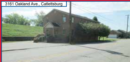
3161 Oakland Ave., Catlettsburg