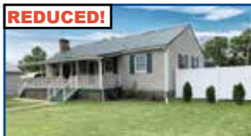
839 Vine St., Raceland - 3 BR, 2 BA, 2,134+/- sq.ft. $139,500 (CCJ)