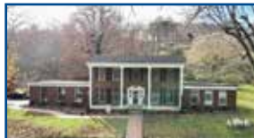
24203 Jacks Fork Rd., Rush - 30+/- Acres. 5 BR, 4 BA. Open concept entertainment area. Black barn-great for storage. Red barn w/10 horse stalls, kitchenette & 2 half baths. $495,000 (CP)