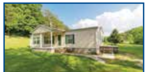
716 Stephens-Meade Rd., Ashland - Ready to go 4 yr old ('15) manufactured 1 floor 3 BR, 2 BA home w/just over 1,600+/- sq.ft. on a gorgeous 9+/- acres + pond w/lg 2 car det garage in Boyd Co! Permanent foundation. $144,500 (CH)