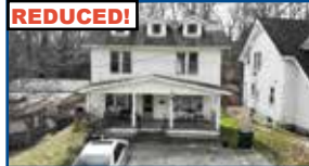
1224 29 th St., Ashland - 3 BR, 2.5 BA, 1,840+/- Sq.Ft. Many updates. Would make great starter home or Investment Property. $62,500(CP)