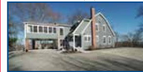
1520 Chestnut Hill Dr., Ashland - Craftsman style home in PRISTINE condition. 5 BR, 3.5 BA, 2 car det garage w/office & full BA. Spectacular views inside & out. $374,500 (CCJ)