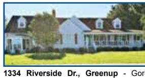
1334 Riverside Dr., Greenup - Gorgeous 5 BR home w/beautiful Olympic sized inground pool & gazebo. Kitchen recently updated w/granite counter tops. Main floor MBR & MBA. So much more. $449,900 (CJ)