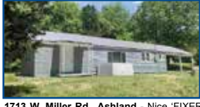
1713 W. Miller Rd., Ashland - Nice 'FIXER UPPER' on 1.32 acres offering 2 BR, 1 BA & 2 car carport. With 1,250+/- sq.ft., this ranch needs some work, but lots of potential. Nice size LR & DR. Fairly private area for enjoying nature from your front porch. $54,500 (CCJ)