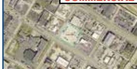
Lots 82,83 & 84 Winchester Ave., Ashland - Prime Business Location in Downtown Ashland. $999,000 (JB)