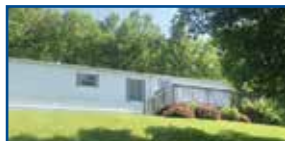
625 Four Mile Rd., Rush - Well maintained 2 BR, 2 BA w/newer house-grade cabinets & new 5 ft shower w/glass doors. Partial surround deck & back porch, det. garage & blacktop drive. Almost an acre w/beautiful trees & landscaping. $49,900 (LG)