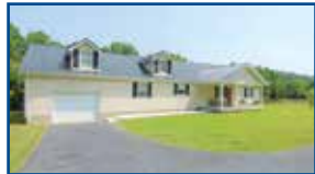
13008 N. St. Hwy 9, Grayson - 3 BR, 2 BA, 2,362+/- Sq.Ft. 2 Acres in a country setting but convenient to town. $159,500 (EM)