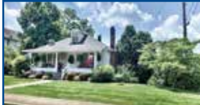
2308 Moore St., Ashland - Check out this 1 floor plan retirement friendly home w/3 BR & 1 BA! 1 car garage in bsmt. Main floor offers 2 BR, 1 BA, laundry/craft room, lg LR w/nice HW floors. $74,500 (CCJ)