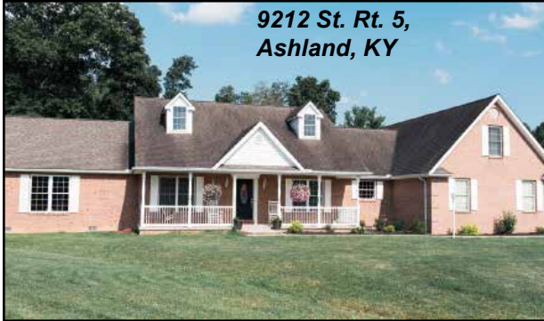
9212 St. Rt. 5, Ashland, KY