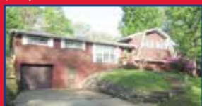
116 Blantel Dr., Russell