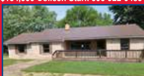
132 Matilda, South Shore

Spacious brick ranch on corner lot in desirable subd. Covered front porch, rear deck, fenced yard, 2 storage bldgs. Modern kitchen w/appliances. LR w/frpl. FR could be 3 rd BR. $114,900 Colleen Stark 606-922-0485