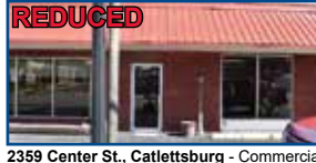
REDUCED 2359 Center St., Catlettsburg - Commercial building. Formerly operated as a beauty shop. Great parking, 2 BA, lots of garage doors. $159,900

3152 Railroad Ave., Ashland 2 BR, 1 BA cottage. $30,000 Call Easter 606-923-5095