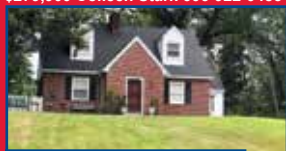
108 Buena Vista, Ashland

Motivated Sellers. 3 BR, 3.5 BA 2 story w/screened deck, cherry HW floor, formal LR w/frpl, DR, Den Media room, walkout bsmt, 2 car garage. $230,000 Leigh Ann Gross 606-571-4258