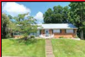
3227 Floyd, Ashland $129,900 Conveniently located 3 BR, 1.5 BA w/LR, DR, spacious eat-in kitchen w/2 pantries and newer updates. Relaxing back patio, flat fenced back yard, 1 car at garage, carport & 10x12 bldg.