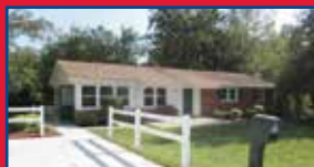
422 Oak Terrace Dr., Ashland

Spacious 7 BR, 3.5 BA ranch on apx. 75 acres. Barn, Inground pool/patio, 3 sun rooms, 2 FR, new septic system, 2 car det. garage. $219,900 Colleen Stark 606-922-0