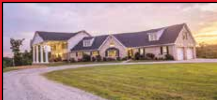
5222 Dog Fork Laurel, Catlettsburg $1,299,000 - Escape the daily grind in this tranquil location surrounded by 76+/- acres & 1.8 miles of vinyl fencing w/2 ponds. This beautiful home offers 5 BR, 4 full and 2 half BA and has been completely remodeled with high end finishes. A peaceful end to busy days.