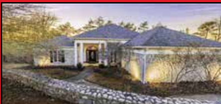
2979 Terrace Lane $599,900 - Fantastic home with 6.9+/- acres in the city with a large pond! 4 BR, 3.5 BA, kitchen w/granite, high ceilings & beautiful hardwood floors. Amazing views!