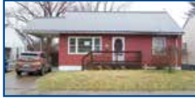
REDUCED 4229 Blackburn Ave. 3 BR, 2 BA vinyl ranch. Investor Alert, this home has been converted to a duplex. Asking $109,500