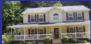
3525 St. Hwy 396, Olive Hill $149,900 3 BR, 2.5 BA, 4+/- acres. Nice 2 story in country setting, WB frpl, 2 heatpumps, wrap-around porch plus more. Franci Burchett 923-6168