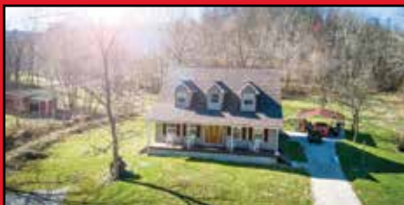
590 Gas Plant Rd., Grayson $349,900 3 BR, 2.5 BA, 1,800+/- sq.ft., 163 Acres full of wildlife trails, 1/2 acre stocked pond, benches, waterfalls & so much more. A True Hunter's Paradise!