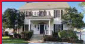
3643 Old Orchard Dr., Ashland

Colonial w/HW floors, Den w/book shelves, breakfast area off kitchen, pantry, formal LR, DR, oversized FR w/frpl & bar, spa room, 5 BR, 3.5 BA, oversized garage & unfin. bsmt. $279,900 Colleen Stark 606-922-0485