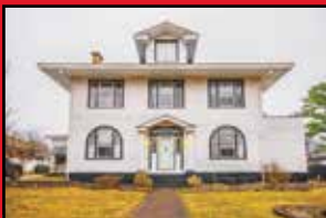
1311 Kentucky Ave., Ashland $159,900 5 BR, 3.5 BA, 5,038+/- sq.ft. Excellent Location w/Lots of Storage & Space.