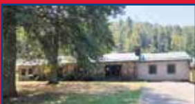
11495 S. Hwy 3, Louisa

Spacious 4 BR, 3 BA brick in Bellefonte area. HW floors, custom kitchen w/ appliances, formal LR & DR, Master suite on main w/access to bonus loft, full walkout bsmt w/FR, BA & laundry. $219,900 Colleen Stark 606-922-0