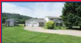
11765 St. Rt. 1, Greenup

Colonial w/HW floors, Den w/book shelves, breakfast area off kitchen, pantry, formal LR, DR, oversized FR w/frpl & bar, spa room, 5 BR, 3.5 BA, oversized garage & unfin. bsmt. $279,900 Colleen Stark 606-922-0485