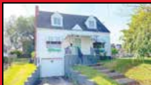
1620 Spring Park, Ashland $72,900 - Tons of potential with a lot to offer! Charm galore in this home on corner lot offering 3-4 BR, 2 full BA w/LR, formal DR, FR that can be 4th BR on main level if needed. The BRs are spacious & there are 2 washer/dryer hookups.