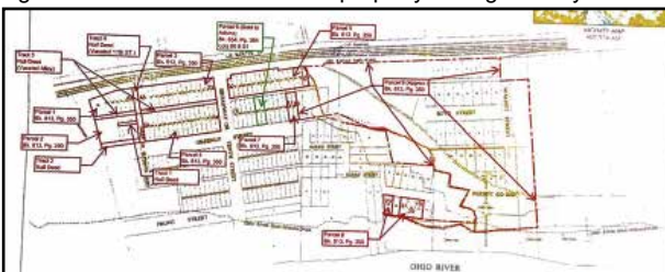
COMMERCIAL PROPERTY 53 Street & Winchester Ave. $3.5 Million - Industrial

Buildable lot in a desirable neighborhood! House seat, perked land and access from Cherrywood & Dalton Ct.