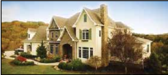
3530 Pleasant Valley Dr., Catlettsburg, KY $1,750,000

80 Acres with many trails and 2 fully stocked ponds. This custom home offers over 10,000 sq.ft. with 3 floors & fully fin. bsmt. The 1 st floor features HW floors, GR w/dual fireplace & built-in bookcases, striking DR, 1 st floor laundry & mud room, kitchen w/travertine tile, stainless appliances, double ovens, 6 burner gas stove w/hot water pot filler, French door refrigerator, walk-in pantry, Butler's pantry & breakfast area overlooking the back yard. The master suite opens to the back deck and offers his & her closets, sitting room, MBA w/ double bowl sinks, walk-in tiled shower & deep soaking tub. There are 5 BR on 2 nd floor, each w/full baths and a few with secret rooms! The walkout bsmt has over 3,000 fin. sq.ft. w/kitchen, 2 BR, 1.5 BA, lg family room, exercise room, media center and craft room, not to mention all the storage! There is a secret staircase that connects the basement to the finished attic, which is perfect for that "man-cave/she-shed! Call for your private showing!