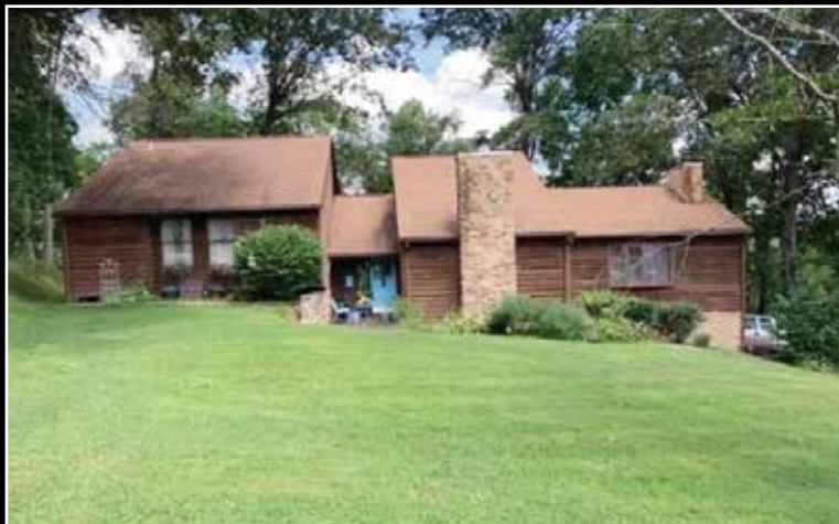
201 Arrowhead Point Grayson $214,900