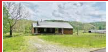
1395 Eureka, South Shore $149,000 3 BR, 2 BA