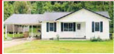
2701 E. US Hwy 60, Grayson - $99,900 3 BR, 1 BA