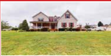
402 Promise Land, Grayson - $299,900 4 BR, 2.5 BA