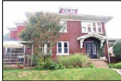
1200 Ashland Avenue Ashland, KY $239,500

80 Acres with many trails and 2 fully stocked ponds. This custom home offers over 10,000 sq.ft. with 3 floors & fully fin. bsmt. The 1 st floor features HW floors, GR w/dual fireplace & built-in bookcases, striking DR, 1 st floor laundry & mud room, kitchen w/travertine tile, stainless appliances, double ovens, 6 burner gas stove w/hot water pot filler, French door refrigerator, walk-in pantry, Butler's pantry & breakfast area overlooking the back yard. The master suite opens to the back deck and offers his & her closets, sitting room, MBA w/ double bowl sinks, walk-in tiled shower & deep soaking tub. There are 5 BR on 2 nd floor, each w/full baths and a few with secret rooms! The walkout bsmt has over 3,000 fin. sq.ft. w/kitchen, 2 BR, 1.5 BA, lg family room, exercise room, media center and craft room, not to mention all the storage! There is a secret staircase that connects the basement to the finished attic, which is perfect for that "man-cave/she-shed! Call for your private showing!