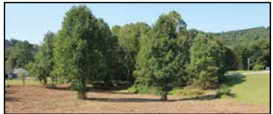
Lot 6 & 2 Sec. 12 Cherrywood Dr., Catlettsburg, KY $25,000

Beautiful property. Great Location. Close to Ashland, yet off the beaten path. Acreage is believed to be 26 acres, but needs to be determined by buyer. Zoning - Road frontage is business and back of the property is single family.