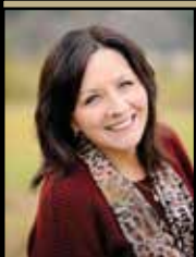
Full-time OH-KY Agent