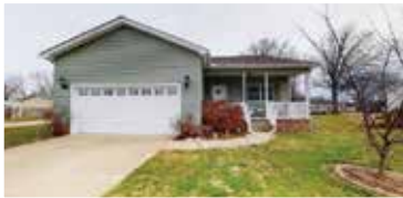
596 Rupert, Grayson $175,000 2 BR, 2 BA