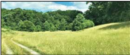
4562 Shannon Dr., Ashland Apx. 26 Acres - $250,000

Built in 1940, this home has been beautifully updated while preserving the original charm. Features include original hardwood floors throughout, lg living room w/gas log fireplace, open formal dining room & a kitchen that is to die for! The kitchen has granite counters, new cabinets, large sink, office area and HUGE walk-in pantry. The sun room makes a perfect transition to the back and side decks. The 2 nd floor features 4 BR & another office area. Each bedroom has large closets. The master features lots of windows, ceiling fan & master bath. The fin. bsmt has a 5 th BR lg enough for a 2 nd family w/amazing closets, an extra den/game room, lg laundry room & a concrete storage area. The attic is a house of it's own with so much storage, high ceiling and lots of shelving. There is a 2 story det. garage and the back yard is perfect for entertaining with decks and fire pit area!