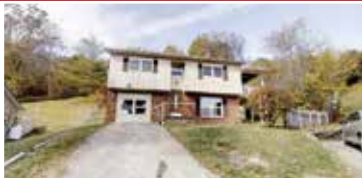
218 Cardinal, Grayson $74,900 4 BR, 1.5 BA