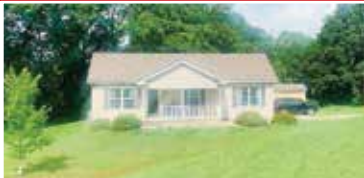
601 Woodville, Grayson $144,900 3 BR, 2 BA, 1.19+/- Acres