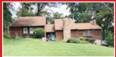
201 Arrowhead Point, Grayson - $214,900 3 BR, 2 BA, .8 Acre lot