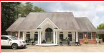
890 Cody Dr., Grayson - $299,900 3-4 BR, 2.5 BA 4+ Acres