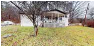
2495 Huff, Grayson $85,900 3 BR, 2 BA, 3+/- Acres