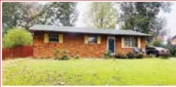
407 Kentucky Ave., Grayson - $99,900 3 BR, 1 BA