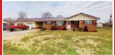
813 Kibbey St., Grayson - $159,000 3 BR, 1 BA, .59 acre lot