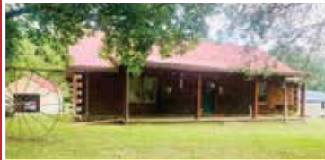
664 Glancy, Grayson $159,900 3 BR, 2 BA, 2.37+/- Acres