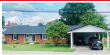
104 S. Court St., Grayson - $149,900 3 BR, 2 BA