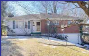
2510 Blackburn Ave. $118,000 3 BR, 2 BA ranch, Hager school district. Very convenient location. #52671 Missi Adkins 923-3129