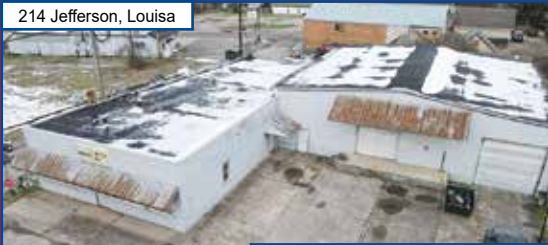
214 Jefferson, Louisa

8535 sq. ft. Multipurpose building at a prime location in Louisa Ky ready for anything! NO MATTER Your business this place likely has something to offer and could adapt to serve you well. This gem located near US 23 and only around 20 minutes from I-64 in the center of the Ky/OH/WV tristate area has been used as a food processing plant and could be again. This place boast of several office spaces, storage spaces, and even some living space if you or your employees put in extra hours and want or need to sleep over. The possibilities for this place seem almost endless. $375,000 Tracy Edwards 606-571-8007