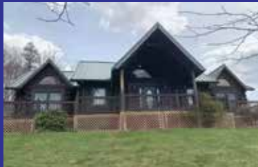
6273 E. Highway 60, Rush $374,900 3 BR, 3 BA, 9.50 acres, log cabin, 2 car garage plus much more. #52572 Nancy Burchett 922-6263 Franci Burchett 923-6168