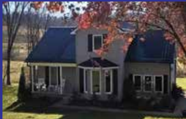
152 Bandy Branch Rd., Sandy Hook $250,000 4 BR, 2 BA, newer gutters, roof & windows, updated farmhouse kitchen & more. #52399 Gayle Clevenger 356-2640