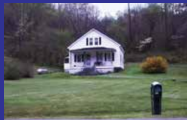
2746 St. Hwy 1661, Grayson $119,900 22+/- acres, 3 BR, 1 BA home. Plenty of woods for hunting & close to Grayson Lake. #52467 Tom Kouns 585-8257

2703 S. 29th St. $213,000 The character, the charm, the history...it can be yours in this early 1900's log home w/modern, updated amenities. The original part of the home has a warm fireplace, gorgeous hardwood floors, & doors & trim w/tons of character. A dining room w/built-in cabinetry leads to the updated kitchen. Upstairs there are 3 BR (one with fireplace) w/wood floors & colonial colors, BA, & walk-in closet. The main floor features a BR & BA, an office w/ built-in shelves, family room, modern BA & laundry hook-ups. There's a screened porch off the kitchen. Plenty of storage in the unfinished, walk-out basement. Mature, seasonal landscaping, wrought iron gate & some fencing. Detached 2 car garage w/finished room. #52445 Missi Adkins 923-3129