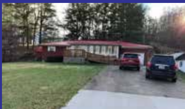
5424 St. Rt. 5 $159,900 4 BR, 2 BA, 2 +/- acres. New HVAC & water heater. #52533 Paul Morgan 316-4074

2703 S. 29th St. $213,000 The character, the charm, the history...it can be yours in this early 1900's log home w/modern, updated amenities. The original part of the home has a warm fireplace, gorgeous hardwood floors, & doors & trim w/tons of character. A dining room w/built-in cabinetry leads to the updated kitchen. Upstairs there are 3 BR (one with fireplace) w/wood floors & colonial colors, BA, & walk-in closet. The main floor features a BR & BA, an office w/ built-in shelves, family room, modern BA & laundry hook-ups. There's a screened porch off the kitchen. Plenty of storage in the unfinished, walk-out basement. Mature, seasonal landscaping, wrought iron gate & some fencing. Detached 2 car garage w/finished room. #52445 Missi Adkins 923-3129