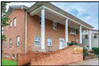
219 Main St., Greenup Office + Apt. $299,900 #51883