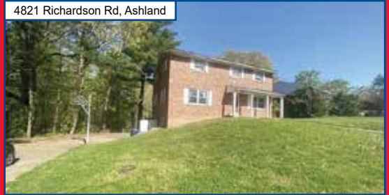
4821 Richardson Rd, Ashland

Lg 8 BR, 2.5 BA home w/2 fireplaces. Good size kitchen w/good storage space & new flooring. Walkout bsmt partially finished. $174,900 Chris Hensley 606-923-9770