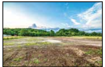
0 St. Rt. 1947, Grayson 2.3 Acres $599,900 #51879