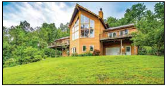
251 Dobbins Lane, Sandy Hook 4 BR, 3 BA, 59 Acres $455,500