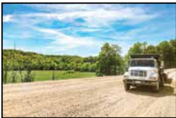
0 St. Rt. 5, Ashland 6 Acres $65,000 #51880