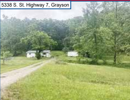
5338 S. St. Highway 7, Grayson