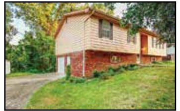
3740 Evergreen Dr., Catlettsburg 4 BR, 3 BA $179,900 #51721