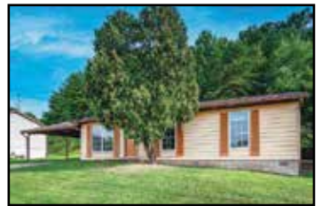
1528 CC Drive, Ashland 3 BR, 1 BA $88,500 #51825