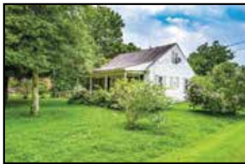
103 Tipton Dr., Greenup 3 BR, 1 BA $69,900 #51669