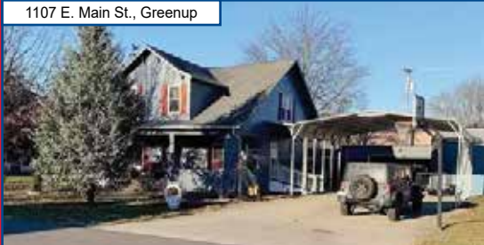
1107 E. Main St., Greenup

Elegant 3 BR, 1.5 BA in heart of Greenup. Beautiful HW floors & trim. Screened porch, det. 2-3 car garage w/ office, storage & room for man/woman cave. $189,900 Tracy Edwards 606-571-8007