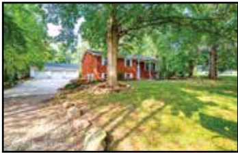
2902 New Haven Ct., Flatwoods 5 BR, 2 BA, 2 Acres $297,000