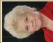
LELA MUSIC 606.498.9075