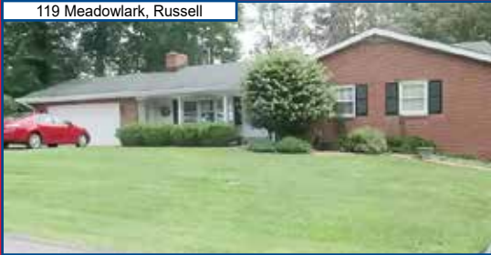
119 Meadowlark, Russell