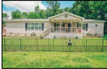
919 Monroe St., Wurtland 3 BR, 2 BA $133,900 #51625