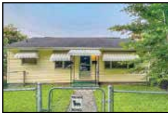
901 Honeysuckle, Catlettsburg 2 BR, 2 BA $79,900 #51683