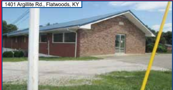
1401 Argillite Rd., Flatwoods, KY

Large Commercial Building with many offices, $299,000 Call Dale Hensley 606-922-9771