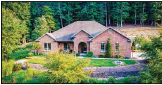
6576 E. KY Hwy 10, Garrison 3 BR, 3 BA, 70 Acres $749,900