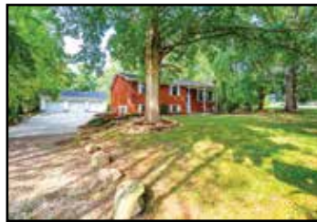
2902 New Haven Ct. Flatwoods, KY $297,000 5 BR, 2 BA. 2 Acres. 2,912 sq.ft. 3 Car Garage #51676