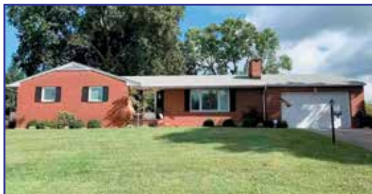
4021 Grandview $259,900 4 BR, 3 BA