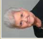
LELA MUSIC 606.498.9975