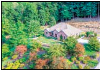
6576 E KY State Rt. 10 Garrison, KY $749,900 6 BR, 3 BA. 70 Acres. 4,161 sq.ft. Multiple Garages. Amazing Infrastructure. #51746