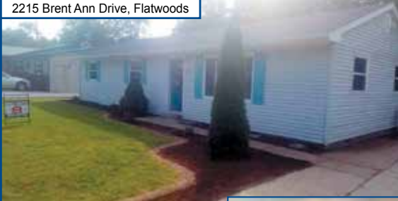
2215 Brent Ann Drive, Flatwoods

Check out this nice 3 BR 1.5 BA ranch newly painted and located in a quiet neighborhood with friendly neighbors. Half bath connects to the master bedroom and the kitchen. Plenty of pantry storage. New roof. Small storage building. $114,900 Dale Hensley 606-922-9771