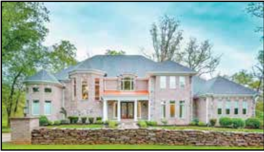
503 Country Club Dr. Ashland, KY 5 BR, 5 BA. 1.3 Acres. 8,694 sq.ft. 3 Car Garage. Elevator. $1,699,900 #51194