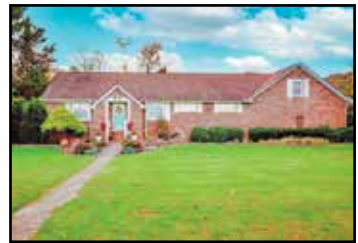
103 Church St. Greenup, KY 4 BR, 2 BA. 1.07 Acres. 2,426 sq.ft. Multiple Garages & Buildings. #52234