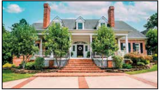
90 Cheshire Lane. Ashland, KY 6 BR, 6 BA. 2 acres. Heated pool. 9,876 sq.ft. $999,900 #51857