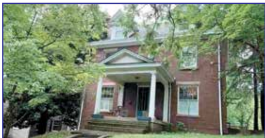
1556 Prospect Place $265,000 5 BR, 2 full BA & 2 half BA