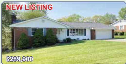
2082 Belhaven Drive, Russell 3 BR, 3 full BA