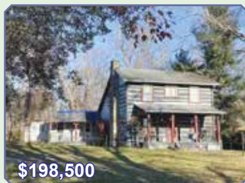
2703 S. 29th St. 4 BR, 3 full BA