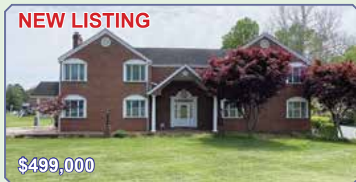
108 Country Club Drive 3 BR, 2 full BA, 2 half BA