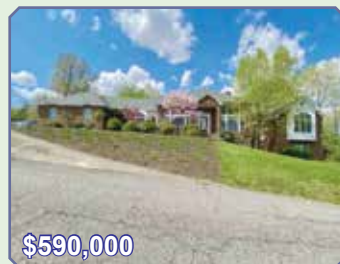
410 Florida Street 3 BR, 4 full BA, 1 half BA