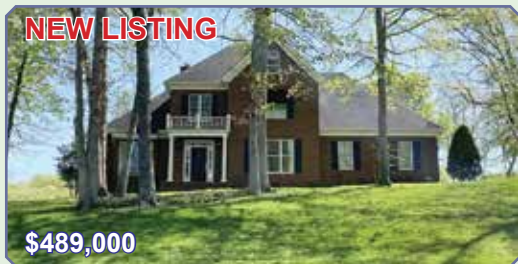
70 Cheshire Lane, Ashland 4 BR, 4 full BA