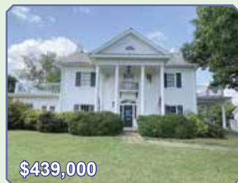
2800 Cumberland Avenue 5 BR, 3 full BA, 2 half BA