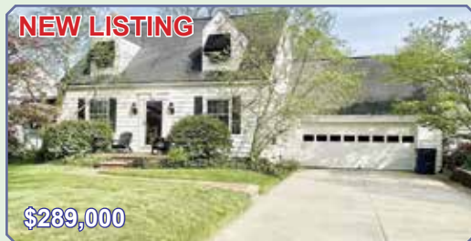
2512 Cumberland Avenue 4 BR, 3 full BA