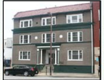
414 11 th Street