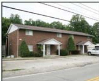
6030 E. Pea Ridge Rd.