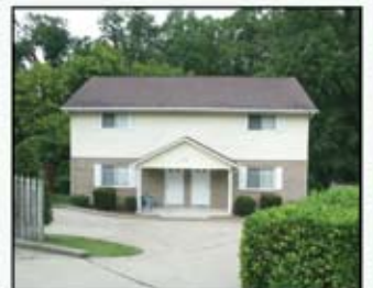
6032 E. Pea Ridge Rd.