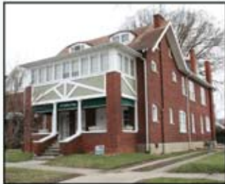
1034 7 th St.