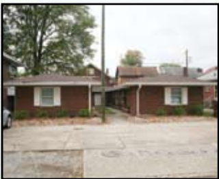
1357 Park Street