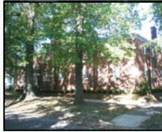
902 11 th Ave.