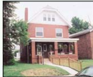
542 6 th Ave.