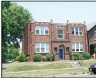
602 10 th Ave.