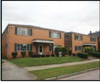
918 6 th St.

1, 2, 3 & 4 BR Units Other Locations Also Available