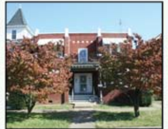
524 7 th St.