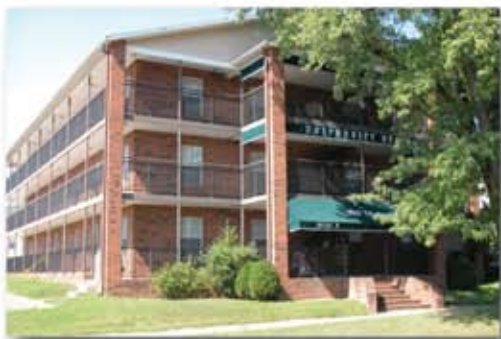
1510 7th Avenue