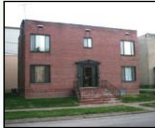
835 9 th Ave.