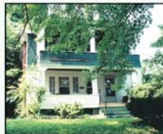
246 6 th Ave.