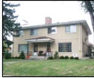
1200 Kanawha Terrace