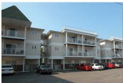
620 15th Street

Email us at dtarter@myvarsityplace.com , call 304-697-5381 , or stop by our Information Center at 613 20th Street.