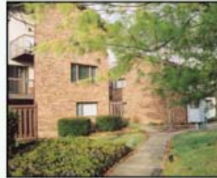
Timberlake Dr. Condos