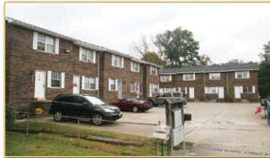
Curry Avenue Apartments