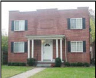
729 11 th Ave.