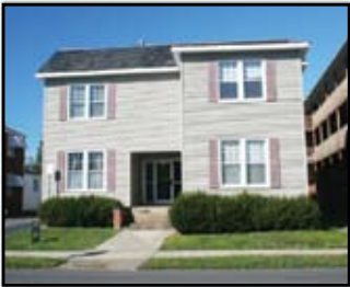
40 W. 7 th Ave.