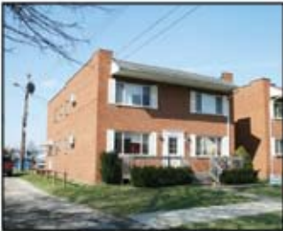
422 W. 9 th Ave.