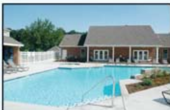
Resort Style Pool