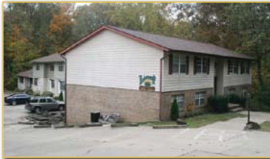
Timberwoods II Apartments