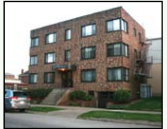
839 9 th Ave.