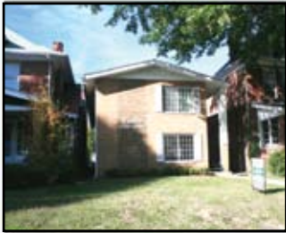
536 6 th Ave.