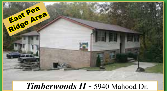
Timberwoods II - 5940 Mahood Dr.