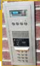
Safety Is Important