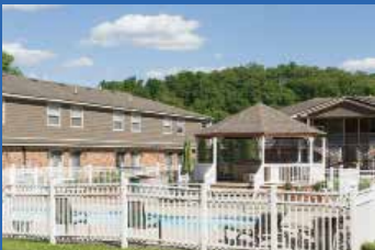
1616 SPRING VALLEY DR.