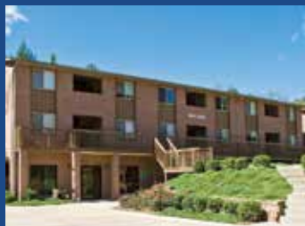
Garden Park 304-736-RENT (7368)