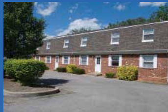
2305 ADAMS AVENUE