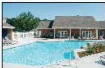
Resort Style Pool