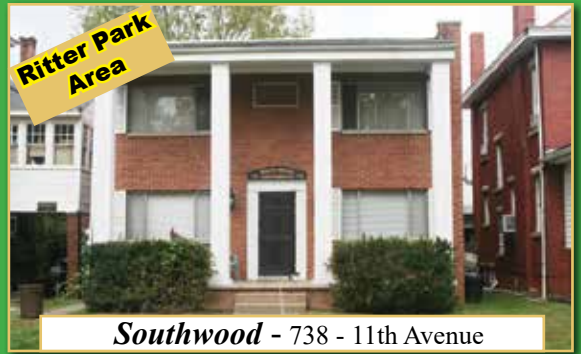
Southwood - 738 - 11th Avenue