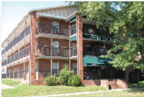
1510 7th Avenue