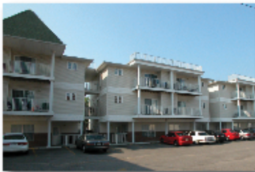
820 15th Street

Email us at dstarter@myvarsityplace.com , call 304-697-5381 , or stop by our Information Center at 613 20th Street.