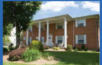
2203 ADAMS AVENUE