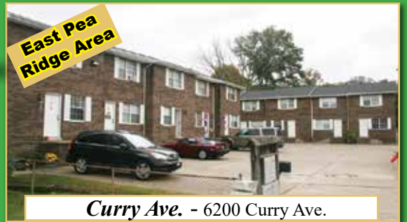
Curry Ave. - 6200 Curry Ave.