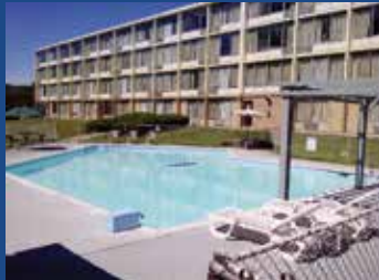
Country Hearth 740-377-2786