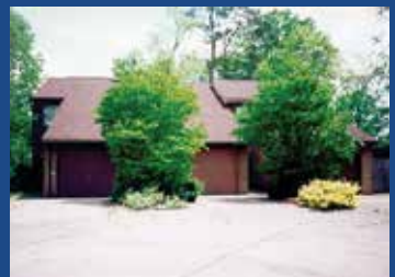
Melody T. Farms Inc. 304-736-2345