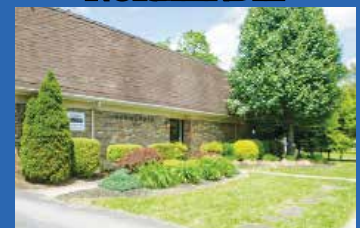
946 MADISON AVENUE

Park Place Properties offers a variety of quality designed studio, one, two and three bedroom apartment homes located near the Huntington VA Medical Center, Marshall University School of Pharmacy, and downtown Huntington.