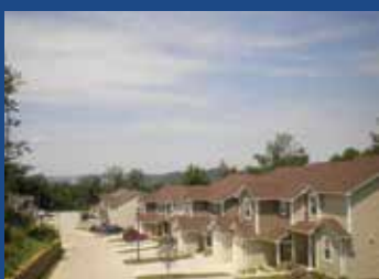
Seneca Ridge 304-399-3400