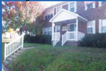
515 MONROE AVENUE