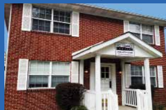
3024 PIEDMONT ROAD