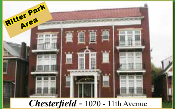
Chesterfield - 1020 - 11th Avenue