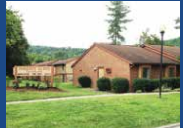
Forrest Bluff Apts. 304-736-1660